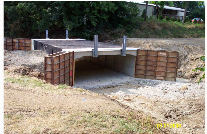
Formed up wing walls