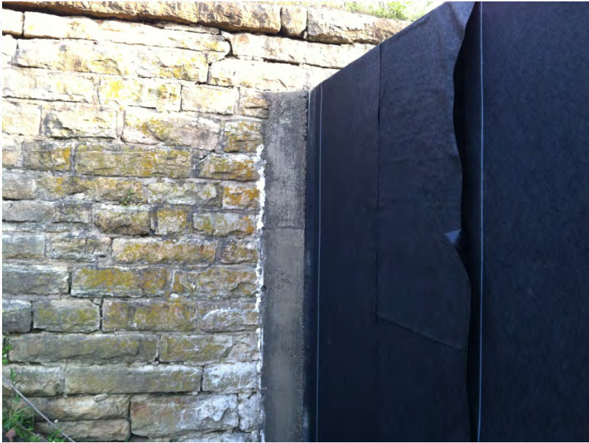
Grouted between new and old