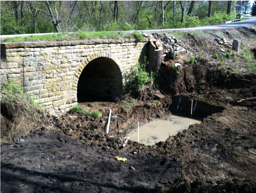
100 year old stone arch