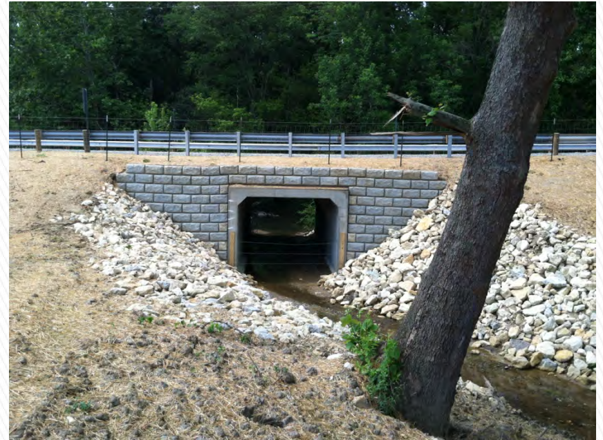
Block headwall We also poured the blocks