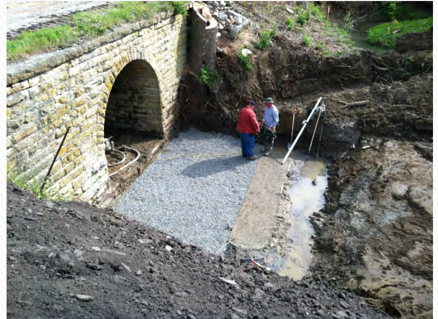
Cut-off footer poured and bedding placed