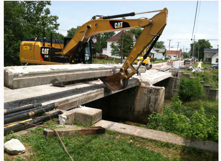
How not to remove beams !