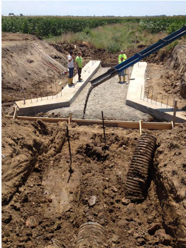
Poured concrete footers